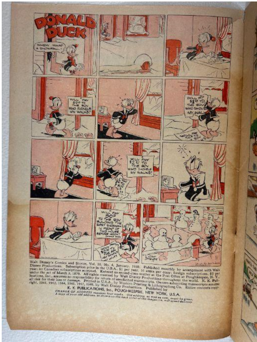
Photo is clear, evenly lit, and shows the full inside front cover, hinge, and margins.