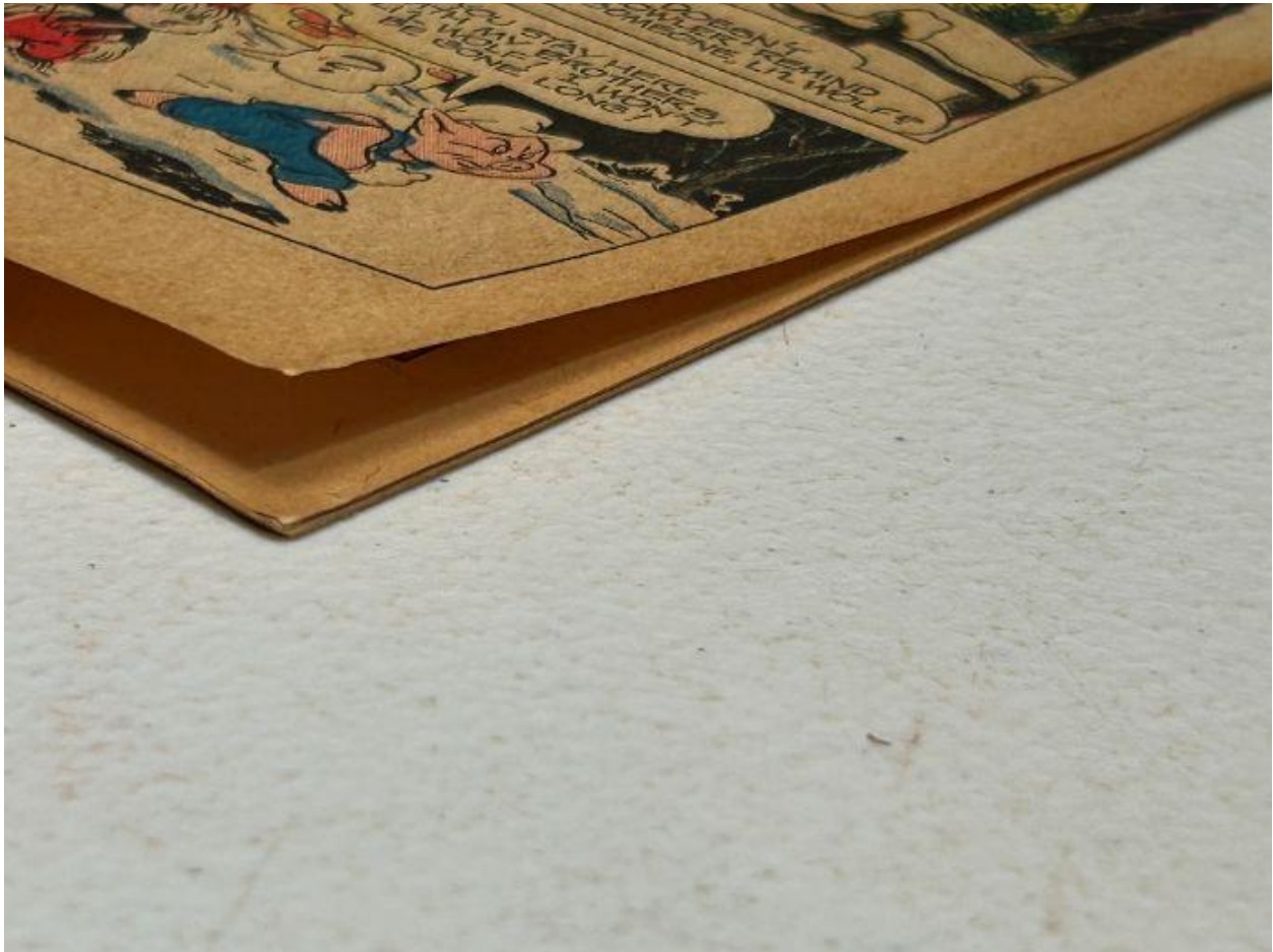
Image clearly shows a single interior page lifted, with adequate lighting to observe paper behavior.